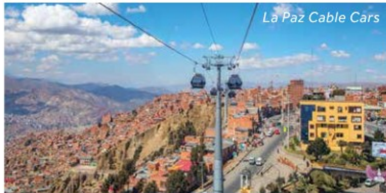
La Paz Cable Cars

Valley of the Moon outside of the city, where rock formations carved by wind and rain create a strange lunar landscape.