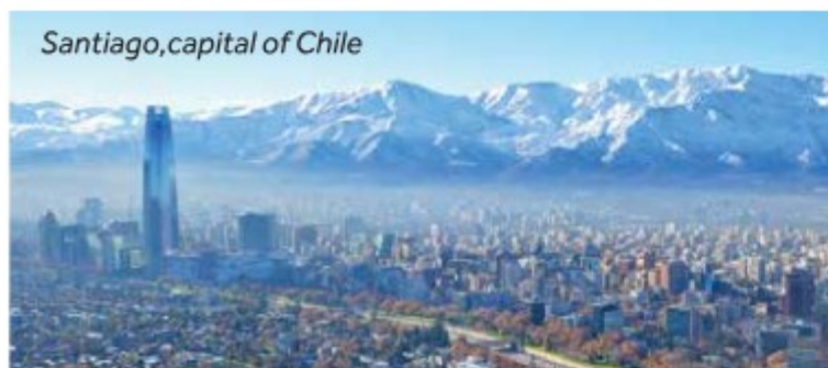
Santiago, capital of Chile

Santiago city tour begins with a visit to San Cristobal Hill with panoramic views of the city. Travel to the heart of the city and Plaza de Armas the spot from where the city has grown throughout the centuries. Visit the Cathedral, the City Council, the Central Post Office and the National Historical Museum . You will also visit some of the original colonial neighborhoods such as Concha y Toro Square.