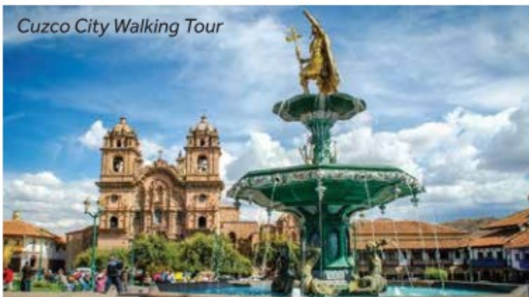
Cuzco City Walking Tour

You are free to explore on own the neighborhood of San Blas, known as the Artist's District. This bohemian quarter is home to art galleries, cafes, and several handicraft markets.