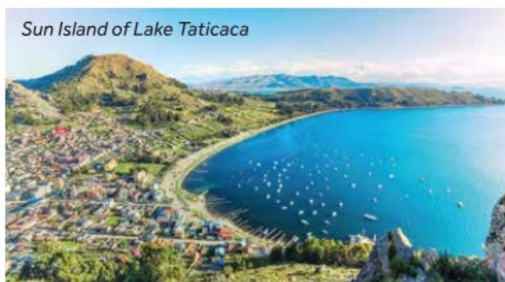
Sun Island of Lake Titicaca

Continue by boat to the ruins of Pilkokaina Inca temple , then return to Copacabana and transfer to La Paz, the capital of Bolivia with stunning views of the Andes Mountain Range.