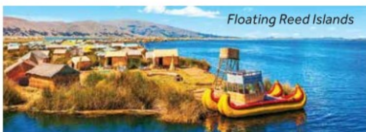
Floating Reed Islands

Take a boat trip to visit the floating reed islands of the Uros Indians and witness their unique way of life! These islands are made of piles of reeds, an ancient tradition of the Uros. They are descendants of the oldest people of the Altiplano, though the present Uros people have mixed with the Aymara and no pure Uros exist anymore.