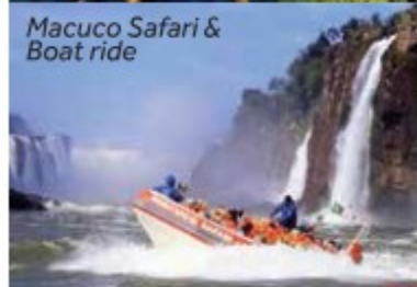
Macuco Safari & Boat ride