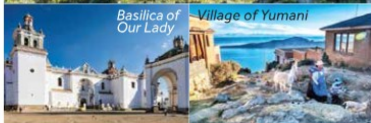
Basilica of Our Lady