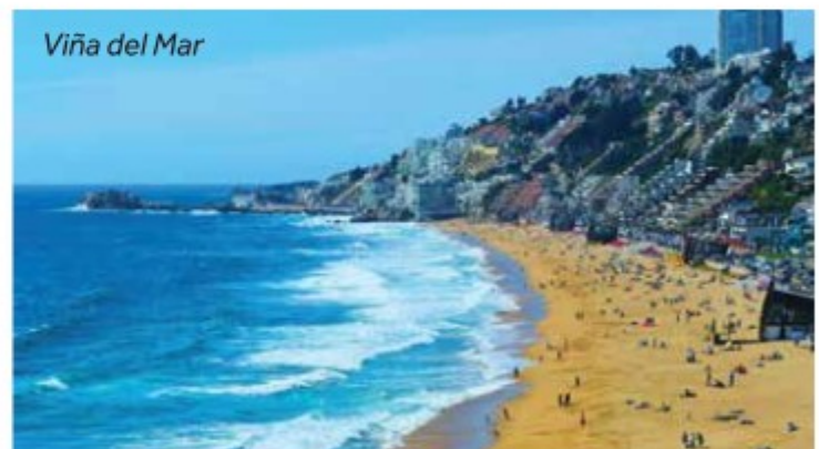
Viña del Mar

Continue to Viña del Mar , known as the Garden City. The Casinos, palaces, and beaches help add to this city's unique character. Admire the Flower Clock, an emblematic symbol of the town.