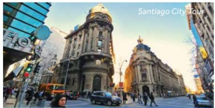
Santiago City Tour