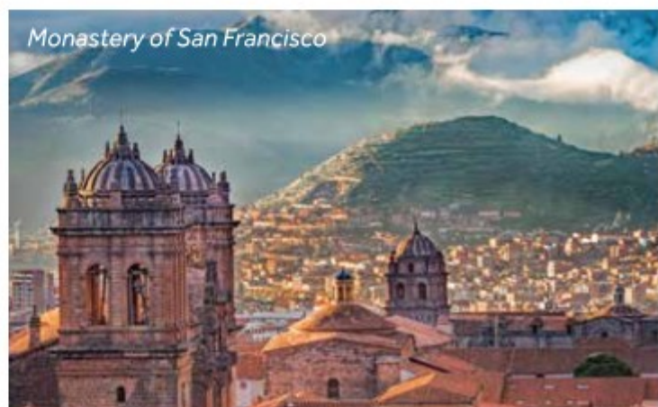
Monastery of San Francisco

Then, visit the Larco Museum , which holds the finest precious metals collection in Peru. Housed in a royal mansion of the 18th-century, the museum is famous for its gold and silver collection, its erotic archaeological collection, and its pre-Colombian art collection. There are over 45,000 objects, all classified by culture and theme in chronological order.