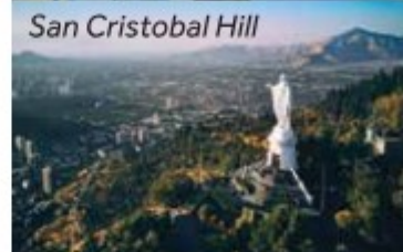
San Cristobal Hill