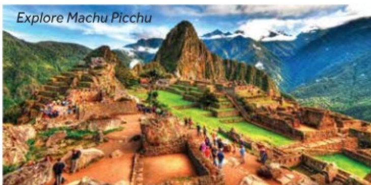
Explore Machu Picchu

You are free to further explore Machu Picchu on your own (entrance and shuttle tickets provided). Return to Cuzco in the afternoon.