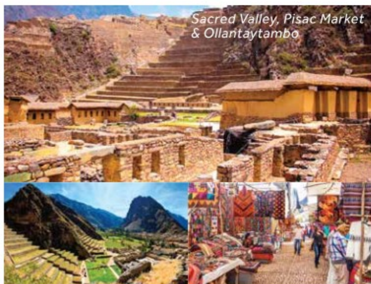
Sacred Valley, Pisac Market & Ollantaytambo

Overnight in the tranquil Sacred Valley, halfway between Cuzco and Machu Picchu.