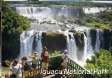
Iguacu National Park