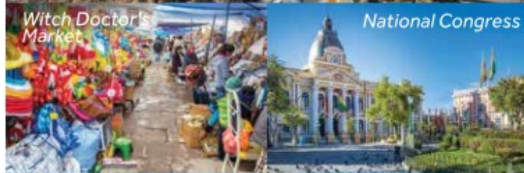
Witch Doctor's Market